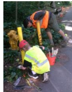
Troop 21 Boy Scouts at Work

(1): Supervisor Gore was generous in assigning his two-day allotment of a crew from the Probation Department to cut back the foliage. We are thankful for this, and, by and large, they did a good job. There are only three or four spots that were missed. If one of these spots is in front of your property or adjacent to it, it would be greatly appreciated if these areas would be cut back so as not to force cars into the other lane. It's all about safety, which is a concern for all of us.