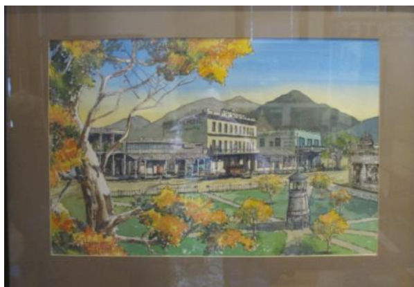
Downtown Healdsburg in 1880s, painted in 1975 by Harmon Cranston Heald, descendant of Healdsburg founder Harmon G. Heald

Readers who missed the event should order a copy of the terrific 31-page issue of the Museum's quarterly publication, Russian River Recorder (Spring 2015, Issue 128). It contains 14 pieces such as "The Big Tree of FM," "It's the Palomar," "The History Mystery of Villa Chanticleer," "FM: My Magnificent Obsession" (by Zelma Ratchford), "Remembering FM Summers of the 1930s," "The Big 'H': A FM Tradition for Thirty Years," and much more, all with historical photos. If you love Fitch Mountain, it's a must for your library.